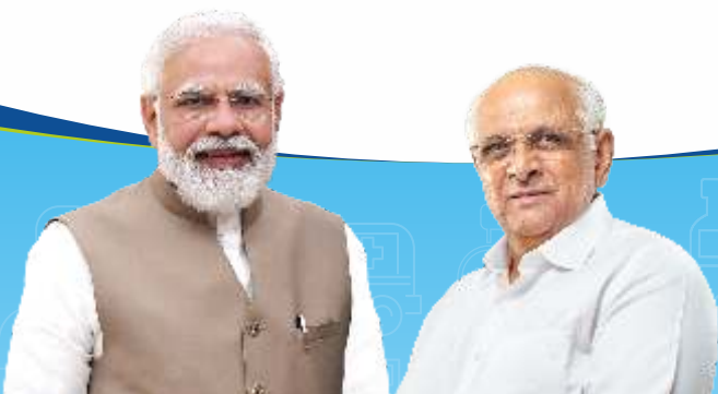
SHRI. NARENDRA MODI Hon'ble Prime Minister of India