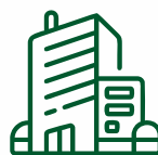
Common Facility Center