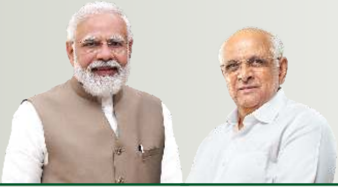
SHRI. NARENDRA MODI Hon'ble Prime Minister of India