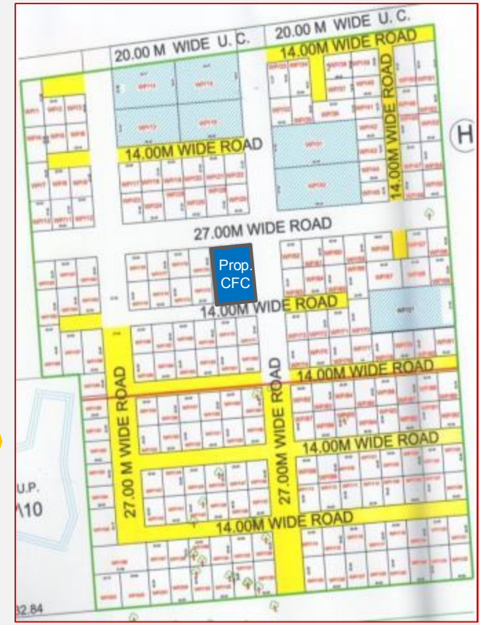
Women Industrial Park, Sanand